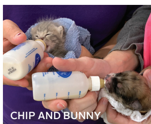
CHIP AND BUNNY

You see, we simply can't do this without you. You directly affect the lives of companion animals right here in the Chattahoochee Valley, and you make all the difference. If you get a chance, please visit us in person, and keep up with us on social media. We want you to see the wonderful work you make possible. Thank you for supporting Paws Humane Society!