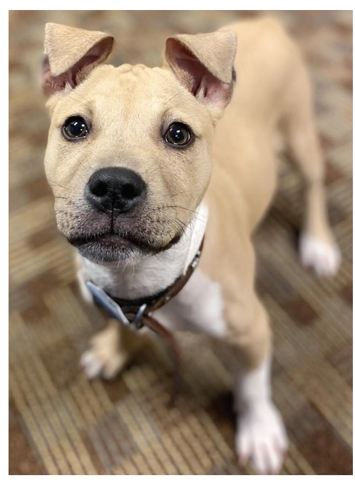
Limp Biscuit at 4 months old

Biscuit received the best care and love any puppy could ask for. Limp Biscuit's leg completely healed and she is now living her best life, running, jumping, and soaking up the love. For more information on how you can make a difference in the lives of our animals as a foster parent, visit pawshumane.org/foster.