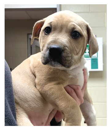
Limp Biscuit at intake

Scared, trembling, and weak, Limp Biscuit was surrendered to us when she was just six weeks old. During her initial medical examination, we noticed she would not put weight on one of her front legs. We quickly discovered she had more than a broken heart; she also had a broken front leg. We put a splint on her leg, then placed her in the loving home of a foster parent until her leg could heal. Unfortunately, we will never know what caused the broken leg or the pain she may have experienced. Thanks to our amazing foster program, Limp